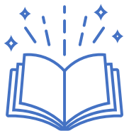
Knowing God's Word

“... for you have put off the old self with its habits and have put on the new self. This is the new being which God, its Creator, is constantly renewing in his own image, in order to bring you to a full knowledge of himself.” – Colossians 3:9b-10 (GNT)